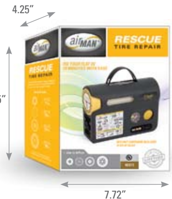
BOX WEIGHT: 5.5 lbs