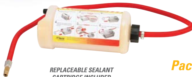
REPLACEABLE SEALANT CARTRIDGE INCLUDED A $29.99 VALUE